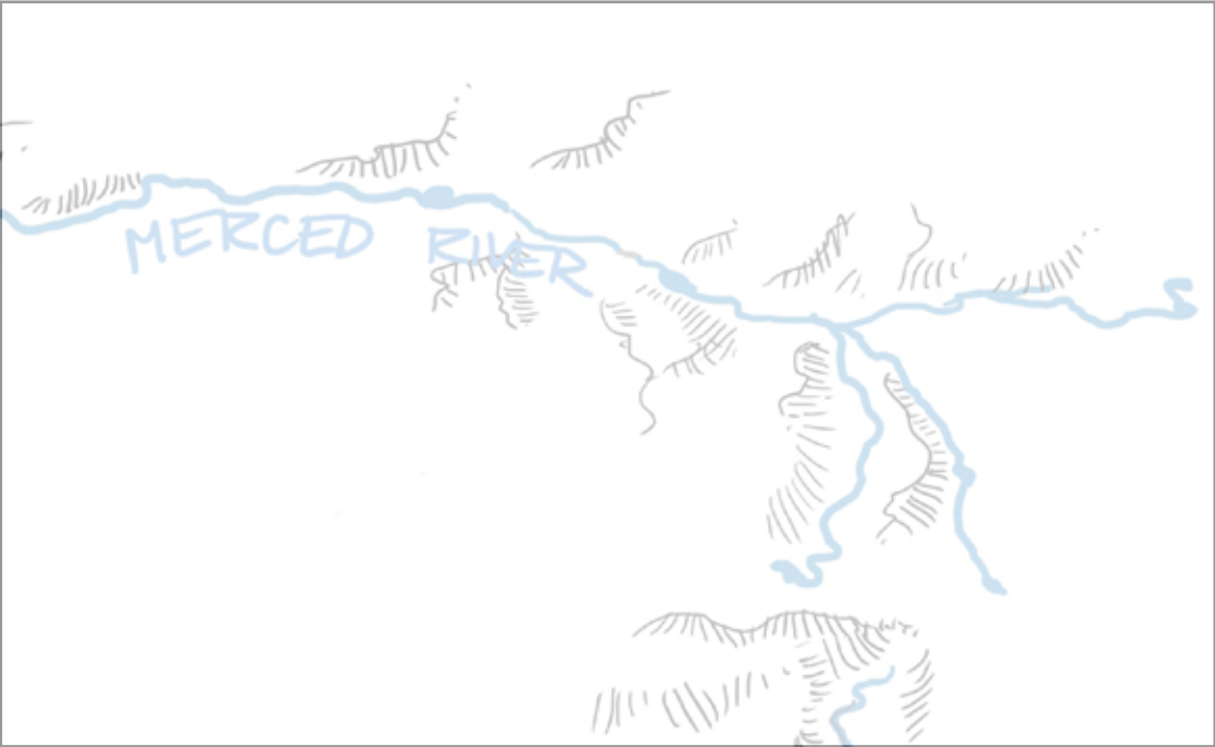
SEGMENT 1: Merced River Above Nevada Fall