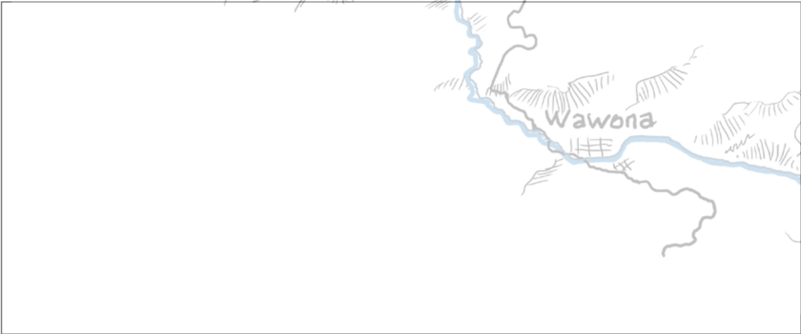
SEGMENT 4: El Portal