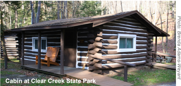
Cabin at Clear Creek State Park

Mile 62.6 to 59.3 (RL) Clear Creek State Park offers developed camping, cabins, hiking trails, canoe access, swimming pond, hunting and trout fishing. Clear Creek has the only riverside